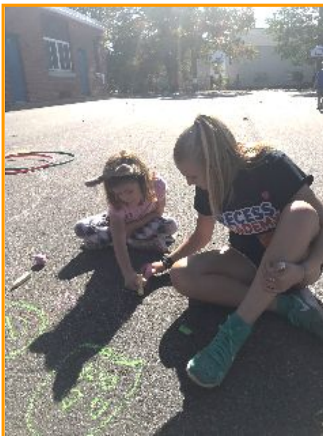
Fun At Recess Academy! Our MT students with helpers from the LHS Athletic Leadership Team